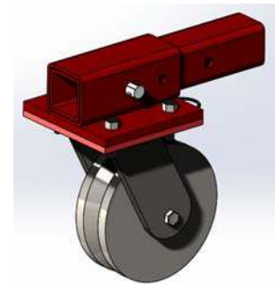
Alternate V-Groove Caster Part No. 5047

Wallace Cranes 71 N Bacton Hill Rd. Malvern, PA 19355